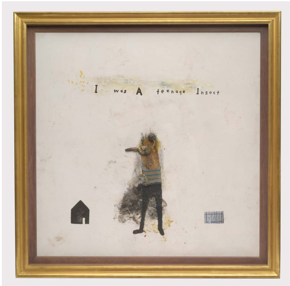
David Lynch, I was a Teenage Insect, 2018, mixed media painting.

In the late 1980s, actress Isabella Rossellini brought the New York gallerist Leo Castelli to David Lynch's painting studio in Los Angeles. About their first encounter, Castelli, a shrewd dealer known for his discerning eye, said at the time, "This man knows what he's doing."