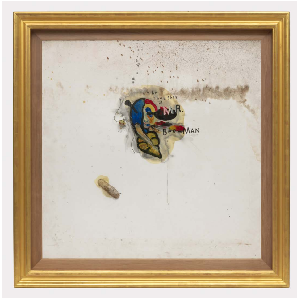
David Lynch, The Thoughts of Mr. Bee-Man, 2018, mixed media painting.

Lynch has taken to calling his studio practice his “art life,” though his work in different mediums intersects. From an early age, long before he even thought of making movies, Lynch knew he wanted to study art. In high school, his friend’s father gave him a copy of Robert Henri’s book The Art Spirit , which theorized that art and life are one and the same, and that artworks are the records of creativity incited by unseen forces. He went onto study, from 1966 to 1967, at the Pennsylvania Academy of Fine Art. One of his first major mature works, Six Men Getting Sick (1967), was a painting that featured the heads of a few men on a panel. It initially included a projection that made it appear as if the men were vomiting, all while a police siren wailed. In certain ways, it could count as Lynch’s first film. He insists he does not know much about contemporary art. “I know nothing about the L.A. art scene!” he said. “I don’t know anything about the New York art scene, the Paris art scene, the German art scene. In the same way with film, I’m not a film buff.”