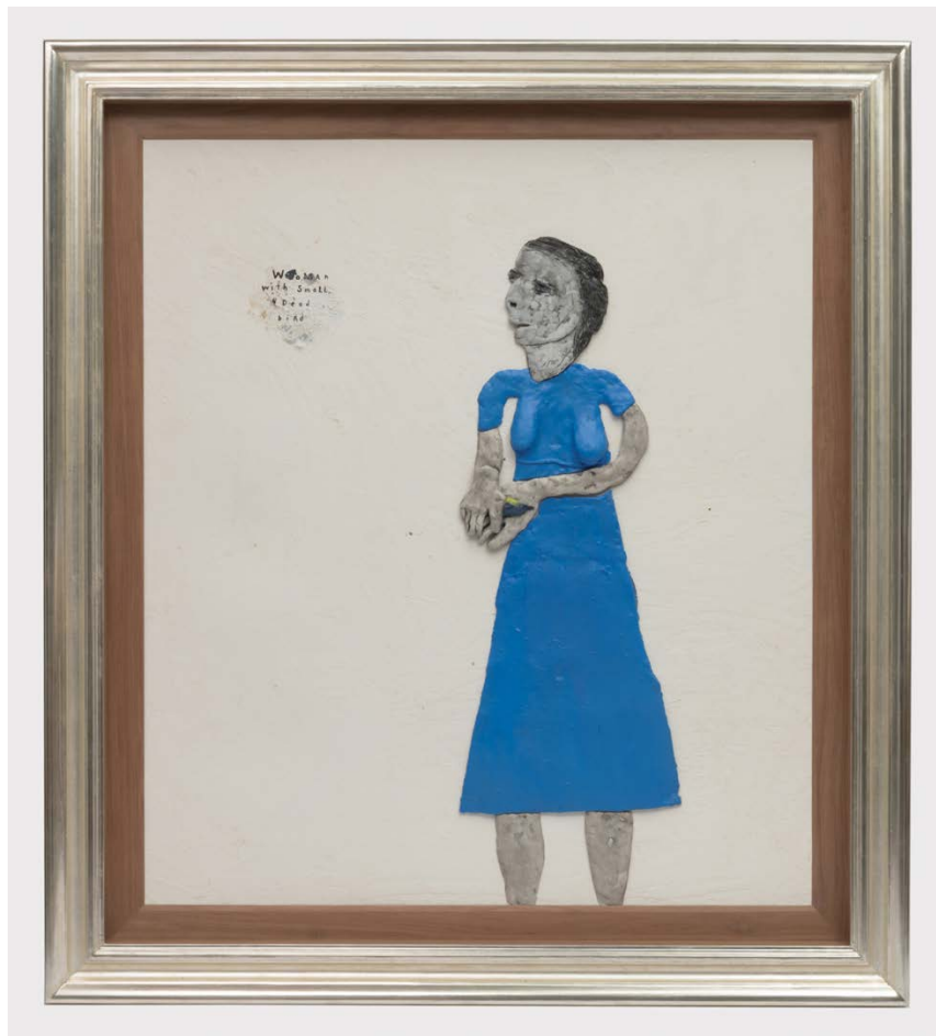
David Lynch, Woman with Small Dead Bird, 2018, mixed media painting.

Decades later, it continues to strike some as a surprise that Lynch, an Academy Award-nominated director whose status is secure in Hollywood lore, has another significant practice devoted to painting, sculpture, printmaking, drawing, photography, and more—so much so that a 2012 essay about his studio work in Hyperallergic took the title “David Lynch’s Art Doesn’t Suck.” But the art world has gradually warmed to Lynch. His paintings were the subject of a retrospective at the Pennsylvania Academy of Fine Art—his alma mater—in 2014. A feature-length documentary about his art practice, David Lynch: The Art Life , followed in 2016. And this season, ahead of an exhibition opening in November at the Bonnefantenmuseum in Maastricht, Holland, Lynch’s art is on show at Los Angeles’s Kayne Griffin Corcoran gallery, which has represented him since 2011. The exhibition, which showcases paintings, watercolors, and drawings under the title “I Was a Teenage Insect,” opens September 8 and runs into November.