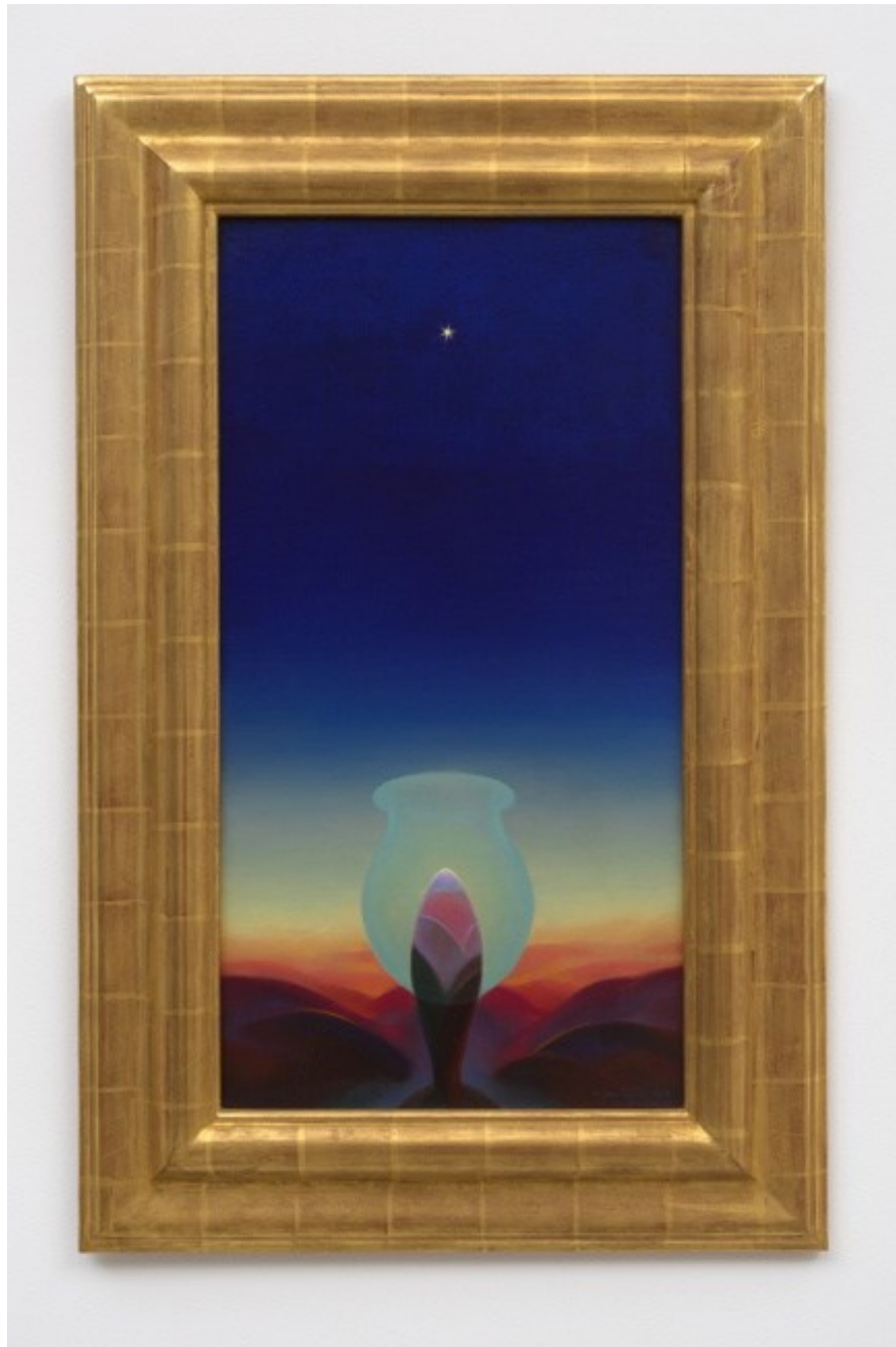
Agnes Pelton, Star Gazer (1929)

becomes a meta-talisman that questions yet refreshes the hackneyed nature of Stonehenge and the pendant's potential mystical significance.